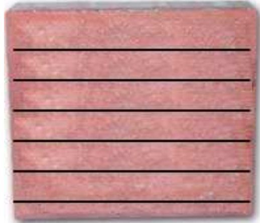
8”x8” Brick – pay $500/brick

(Enter up to 6 lines, maximum 18 letters per line, including spaces.)