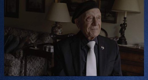
This event is presented in collaboration with: