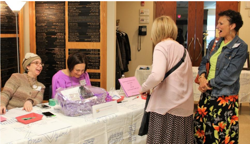
Sisterhood women getting oolong at the Membership Tea