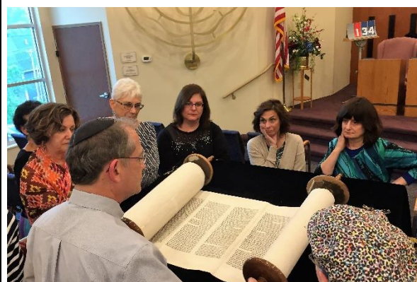
NHBZ women learning laws and customs pertaining to the Torah scroll at the Sisterhood Shavuot Program on May 15.

To help strengthen and support our minyan, please encourage your husbands and sons to commit to regularly attending one, two, three or more minyanim each week. Your encouragement just may make the difference to help inspire the guys to fulfill this vital mitzvah. And, of course, it would be even better if you attend too!