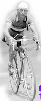
GINO BARTALI 1914 - 2000

RAFFLE: PLEDGES OF 25¢/MILE TO $1.00/MILE ($12.50 - $50.00) = 1 FREE RAFFLE TICKET AWARDED FOR EACH ADDITIONAL $50.00 PLEDGED, ANOTHER RAFFLE TICKET IS AWARDED. (2 TICKETS FOR $100, 4 FOR $200 ETC.) YOU NEED NOT BE PRESENT TO WIN!