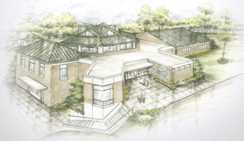
PRELIMINARY DESIGN RENDERING OF THE NEW NHBZ SYNAGOGUE

An Application for Membership is available online at www.nhbz.org or by calling the synagogue office at (314) 991-2100, EXT. 2.