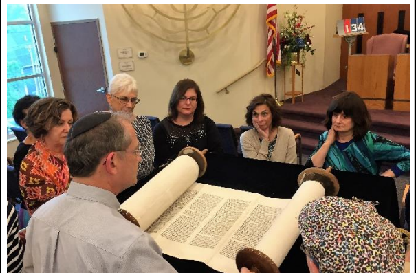
NHBZ women learning laws and customs pertaining to the Torah scroll at the Sisterhood Shavuot Program on May 15.

To help strengthen and support our minyan, please encourage your husbands and sons to commit to regularly attending one, two, three or more minyanim each week. Your encouragement just may make the difference to help inspire the guys to fulfill this vital mitzvah. And, of course, it would be even better if you attend too!