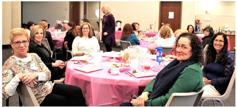
NHBZ Sisterhood members braved the ice to attend the Paid-Up Membership Tea Feb.10