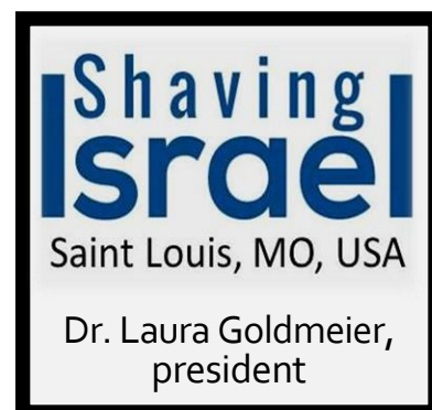
Israel Advocacy Award Shaving Israel