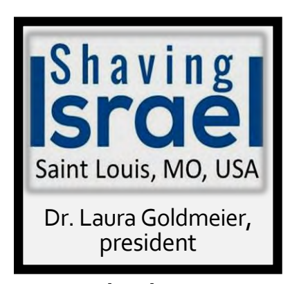
Israel Advocacy Award Shaving Israel