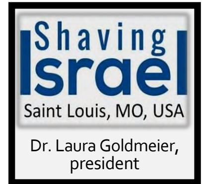
Israel Advocacy Award Shaving Israel