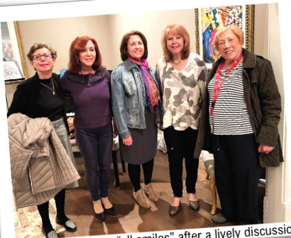
Book Club members "all smiles" after a lively discussion

"A Jew who doesn't believe in miracles is not a realist."