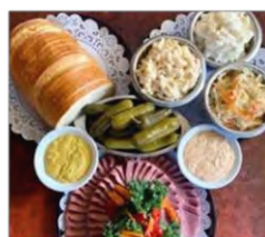
Meals for the sick