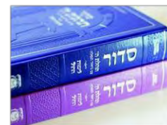
Gifts for bar/bat mitzvah