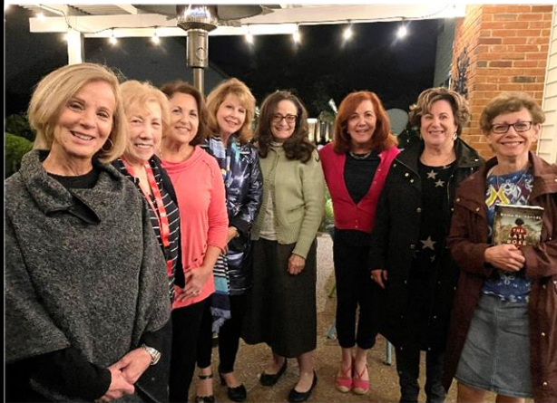
All women are welcome to join us!