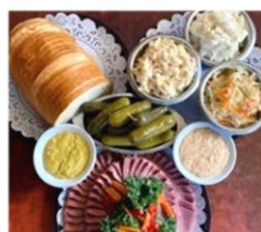
Meals for the sick