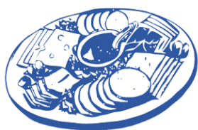
Shiva trays for mourners