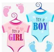
Gifts for newborns