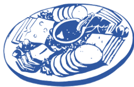
Shiva trays for mourners