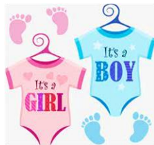
Gifts for newborns