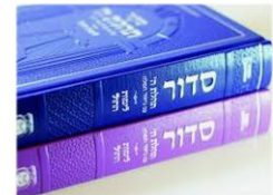
Gifts for bar/bat mitzvah