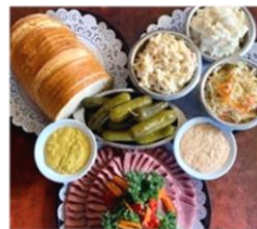
Meals for the sick