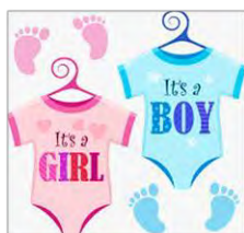
Gifts for newborns