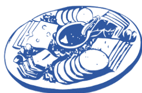
Shiva trays for mourners