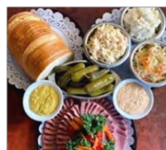
Meals for the sick