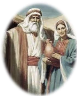
Abraham & Sarah