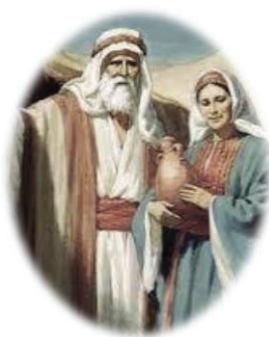
Abraham & Sarah