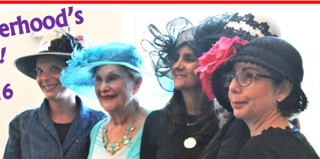
A few of Sisterhood's Fashion Show Fashionistas!