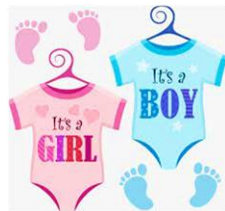
Gifts for newborns